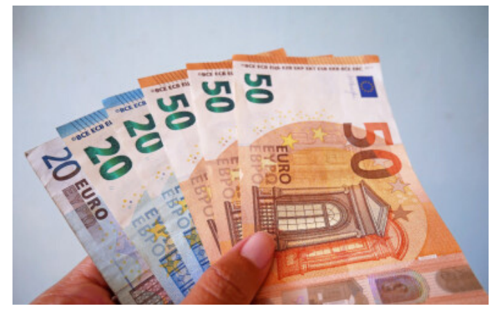
When a person is looking for a job, salary should not be their number one motivation and if it is you are considering hiring the wrong person!!

This is down to the group chats and various online communication forums, this is down to the misconception of practice owners who advertise independently who are of the mind that there are no dental nurses in particular available, and from this dental nurses who do not have the valid experience or skill set are being offered ridiculously salaries that do not match their skill set. THIS NEEDS TO STOP!